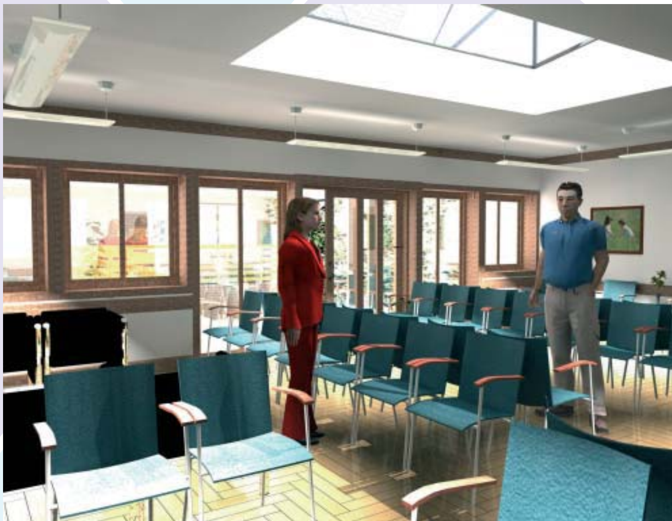
Above: The new patient lounge. Below: The new garden with improved wheelchair access.