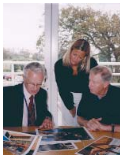
Top: The team at work on the sponsored walk on Brighton & Hove seafront.