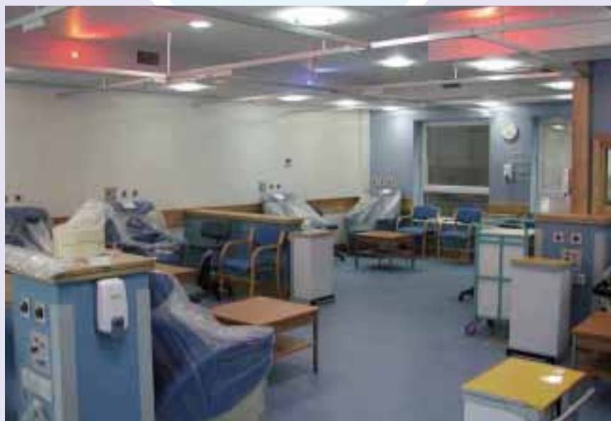
View of the new suite shortly before completion