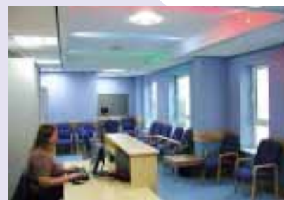
Above: The new waiting area. Below: Internet access